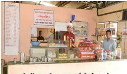
College Canteen / Cafeteria