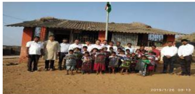
School bag Donation for Adivasi students