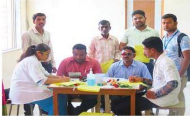
Eye Checkup Camp