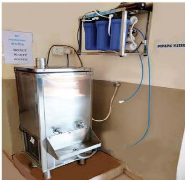
RO drinking water