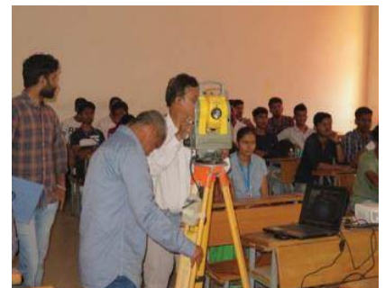
Total Station Workshop