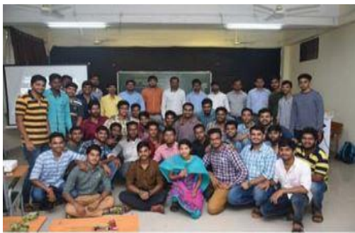
I. C. Engine Workshop