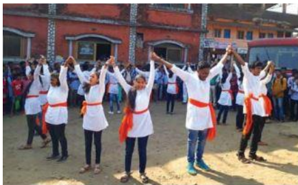
Street Play on Voting Awareness