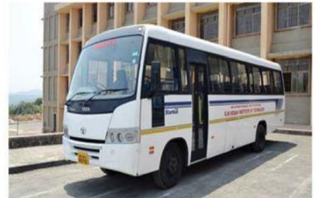
Local Bus Service