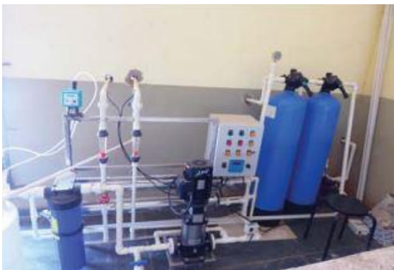
RO water Treatment Plant