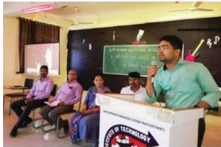
Savitribai Fule Jayanti