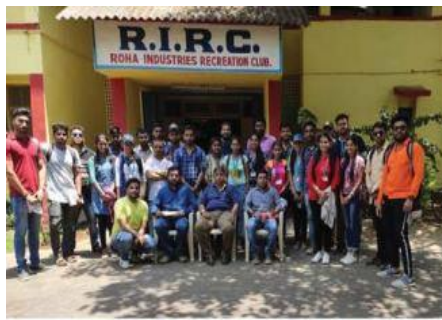
RIRC Roha Industrial Visit