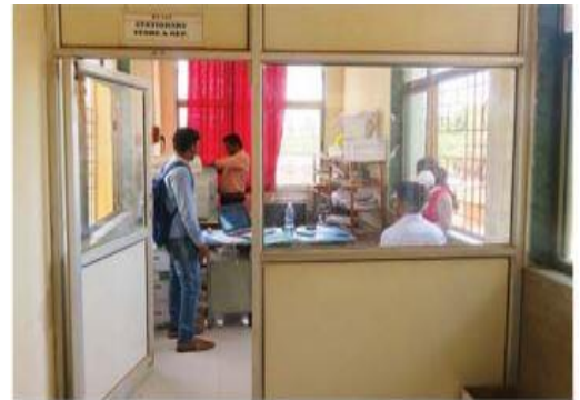
Stationary & Xerox Center