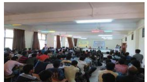
Battle of Minds