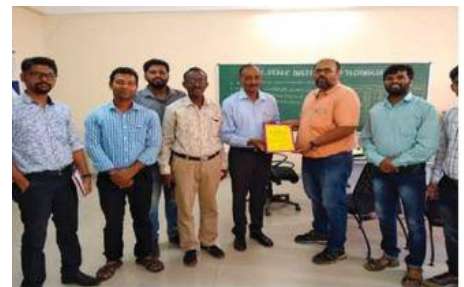
Blood Donation Camp: Lions Health club