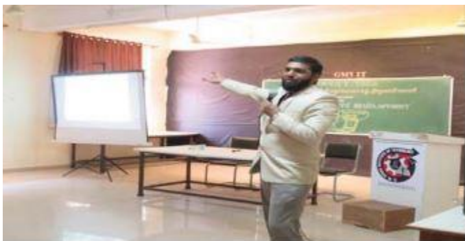
Workshop on Personality Development