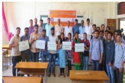
NSS Program: Voting Awareness