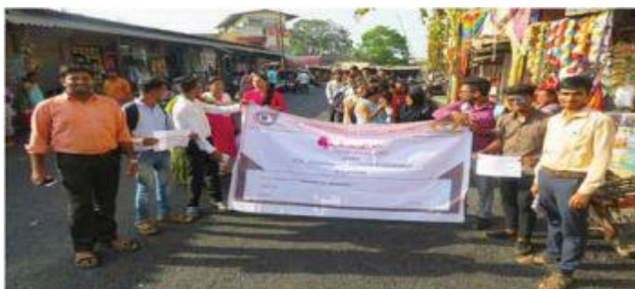
Rally on Womens Right & Empowerment