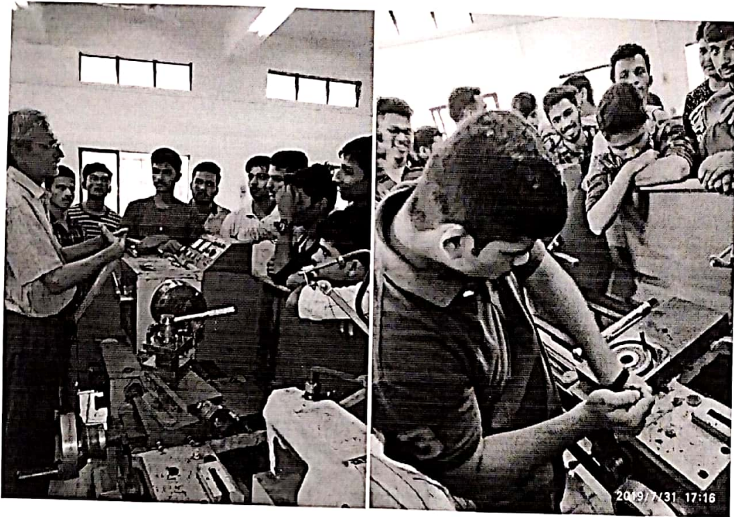
Demonstration and hands on experience of lathe machine dismantling and assembly