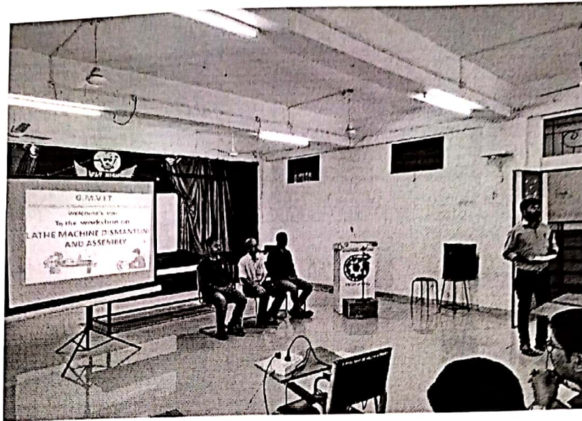
Photograph of theoretical session