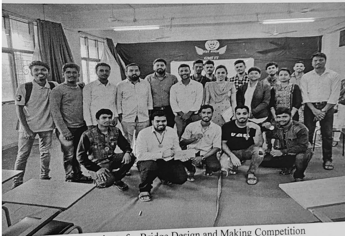
Winner Students for Bridge Design and Making Competition