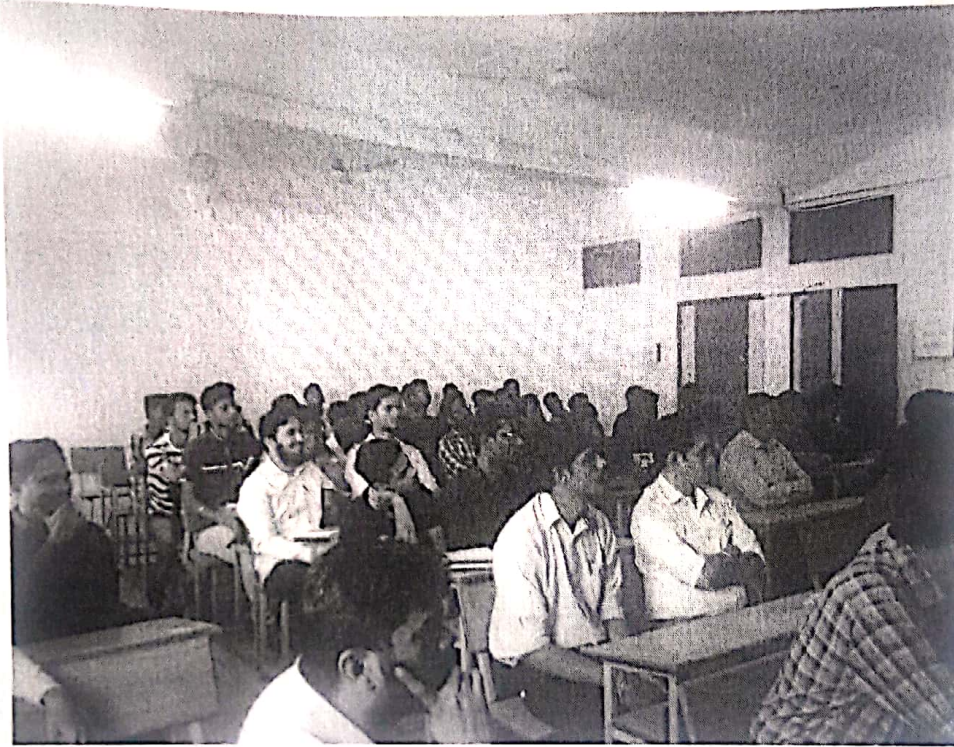
A picture of seminar in progress

Department of Mechanical Engineering Academic Year 2018-19 First Half 2019