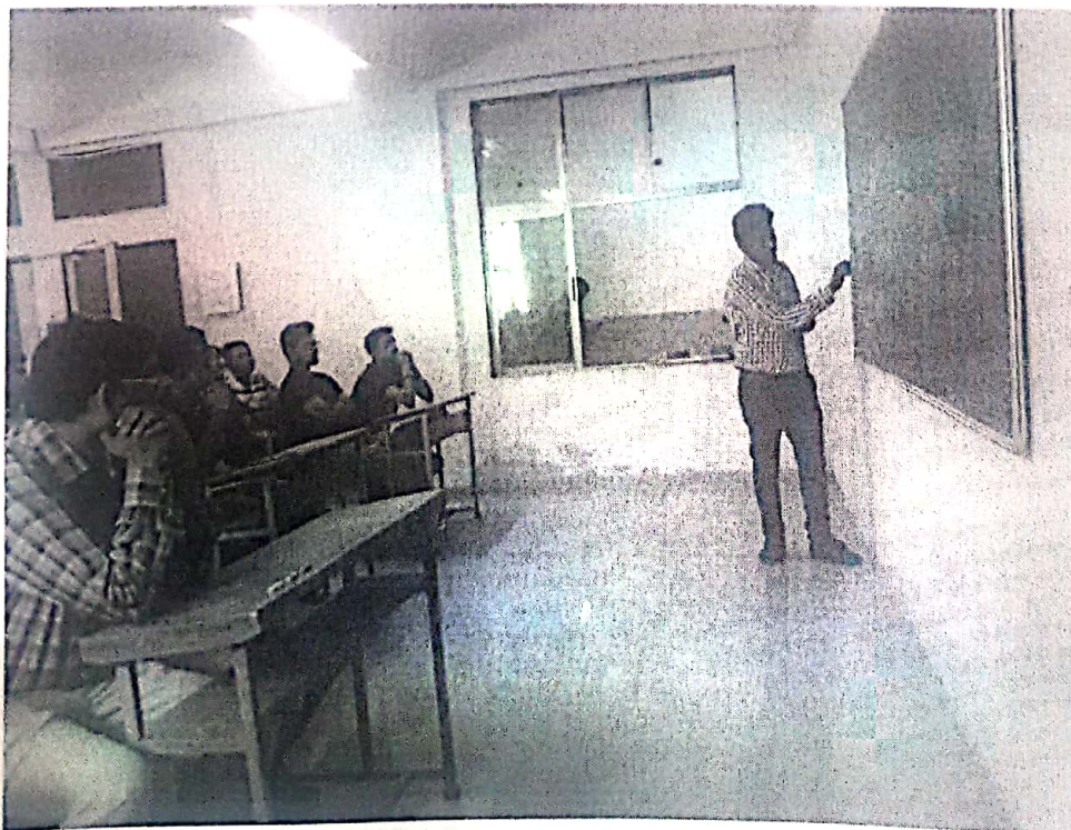
A picture of seminar in progress