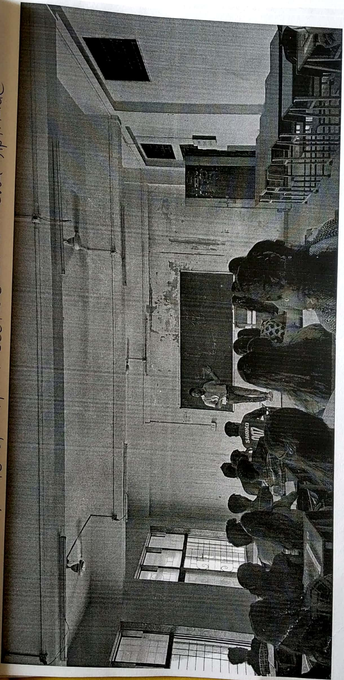
Photo of Expert Lecture on General Aptitude