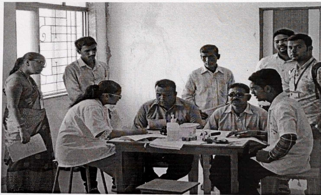
Eye Checkup under Supervision of Medical Officer